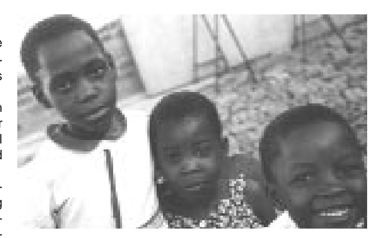
Midwives of the future?

With the WHO training of traditional midwives, disposing of the placenta via a plastic bag into the toilet is being held up as the safe hygienic approach. One of the traditional healers felt that the breaking of this deeply symbolic tradition was the cause of communication breakdown between today's youth and their families and communities.