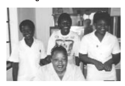
Others whose untiring work must be recognized