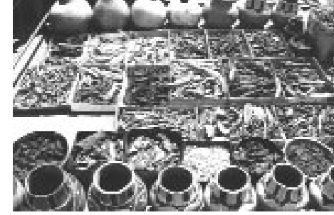
Local herb market in Bulawayo

W Some spiritual traditional midwives from particular churches help women conceive. If they are not conceiving, it is often thought to be caused by bad spirits. They use prayer to secure a good outcome, and continue to pray and counsel and give holy water after the woman has conceived.