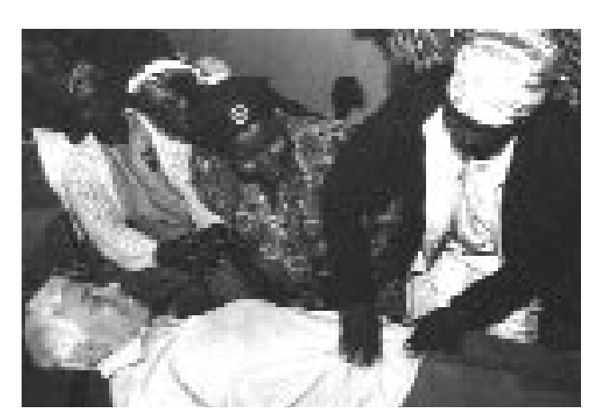
Wintergreen isn't pregnant. But how else are we to learn without touching and laughing?

It is necessary to look at practices and strengthen successes and eliminate failures.