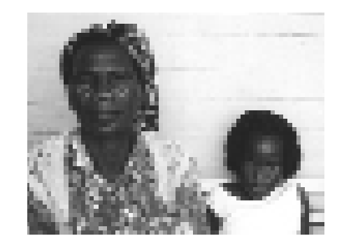
and we learned...