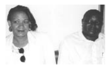
The unsung heros behind the scenes