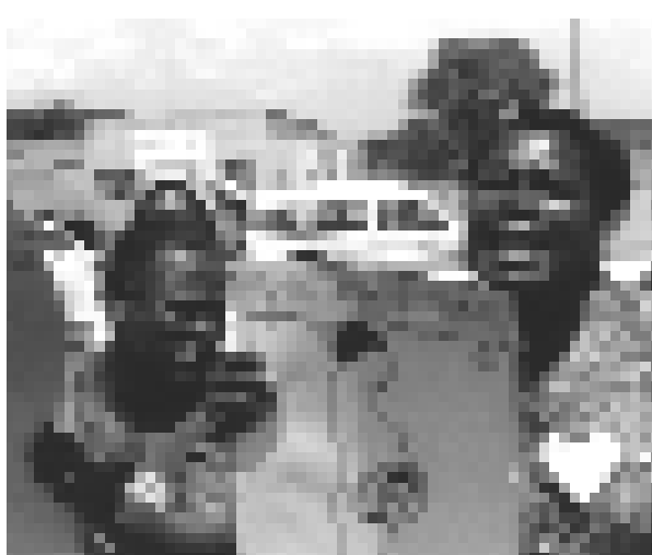
WE CAME IN ALL AGES!