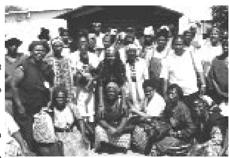
Some of the traditional midwives from the many areas of Zimbabwe. Everyone was eager to have their picture taken, proud to be a part of history!

It was also hoped that there would be more choices available in how to deal with infertility. Some couples may choose to accept not having children.