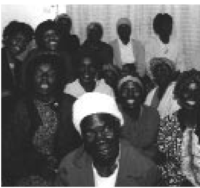
Some of the midwives from Umzingwane Village. Inside their rural clinic.. Our first meeting.

When the signs of second stage are apparent (bulging anus and the mother says she is bearing down) the