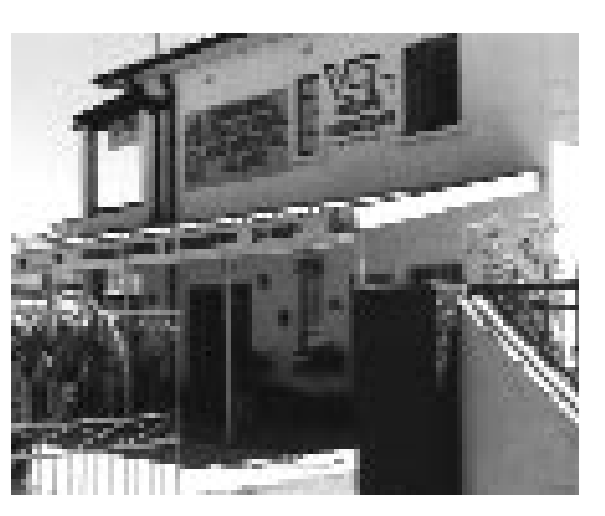
The Zimbabwe Traditional and Medical Clinic